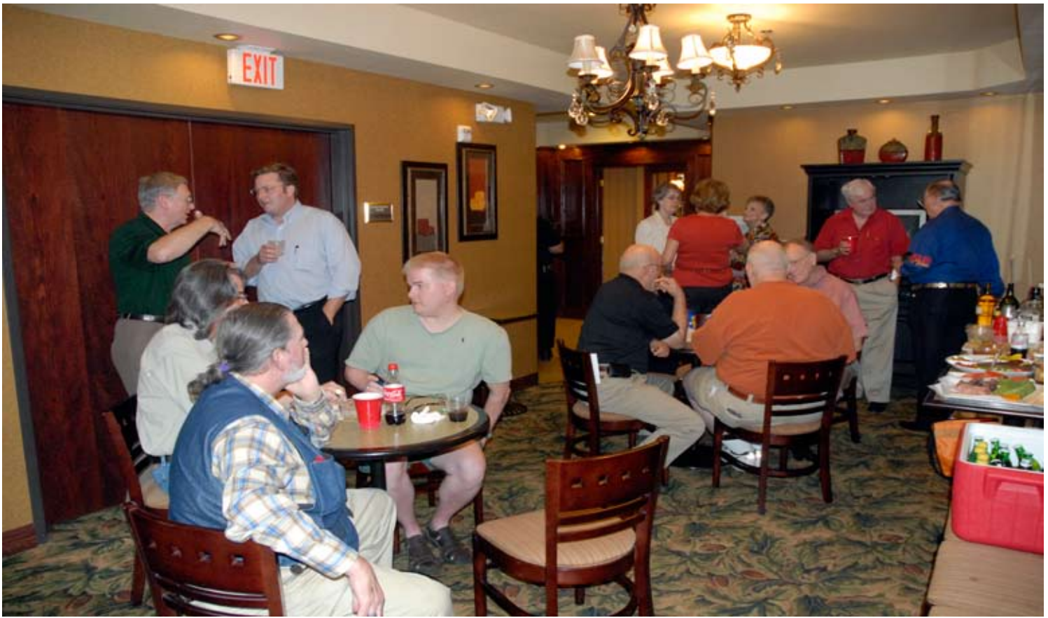
Friday's Hospitality Room was the place to spread out after a long drive.