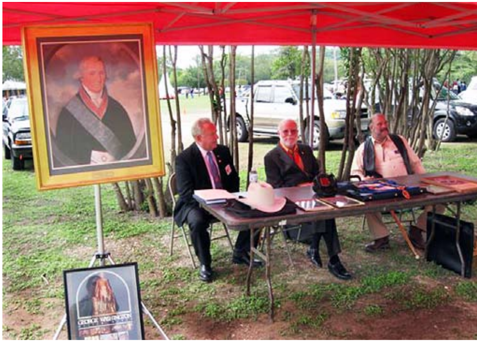
The Texas Lodge of Research booth at the Texas Heritage Music Foundation Jimmie Rodgers Tribute was always well manned.