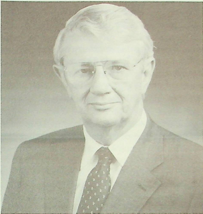
Hon. Jack Hightower